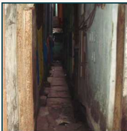
The lane where the family's little room was in the slum