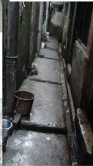
The family's living situation